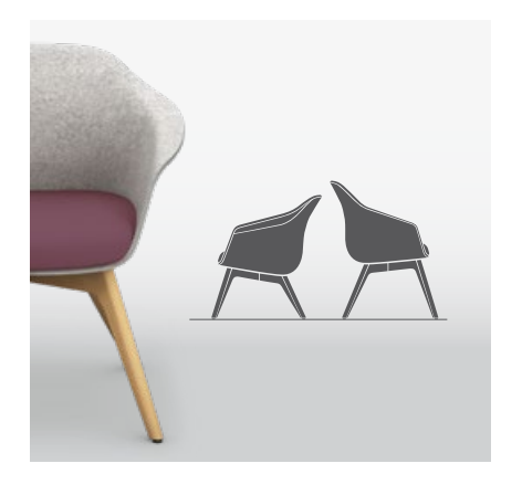
The model with solid wood base is available in two heights and three frame colours