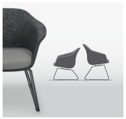
The skid model is available in two heights and six frame colours