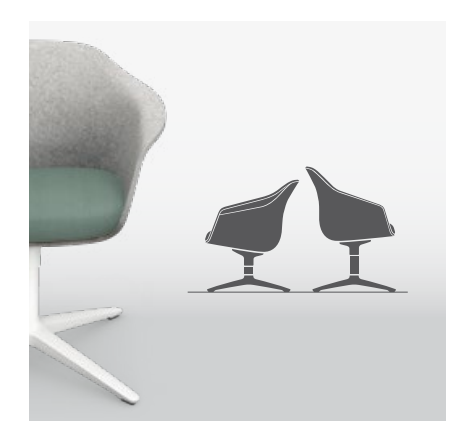
The star base model is rotatable and comes in six frame colours