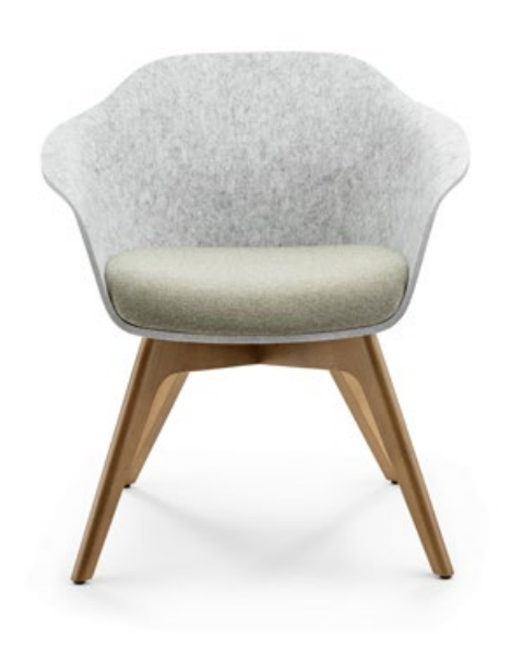
The wooden base is available in three colours and gives the armchair an even more homely character

Wherever working environments turn into feel-good areas, se:lounge light comes into play. The shell armchair unites design and comfort, radiates cosiness and creates a pleasant atmosphere from the very first moment.